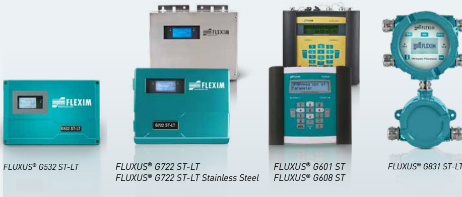
FLUXUS® G532 ST-LT

More than 30 years of experience in the area of non-invasive flow measurement with clamp-on ultrasonic technology